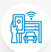
Pay on Exit