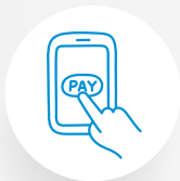
Pay by Phone