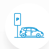
Pay & Display